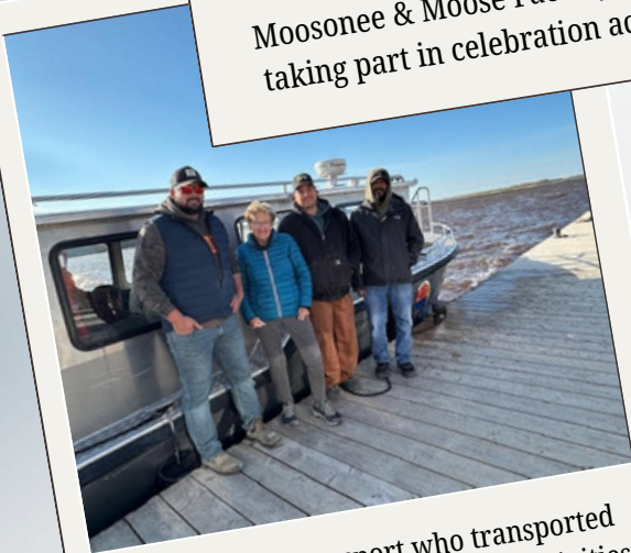
WAHA boat transport who transported numerous people to celebration activities.