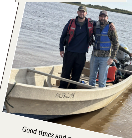
Good times and great weather!