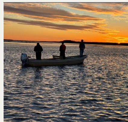
On the water with a beautiful sunset – what could be better?