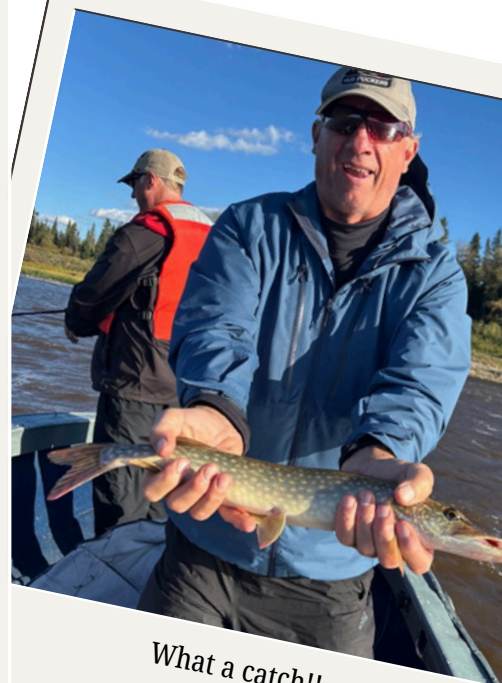
What a catch!!