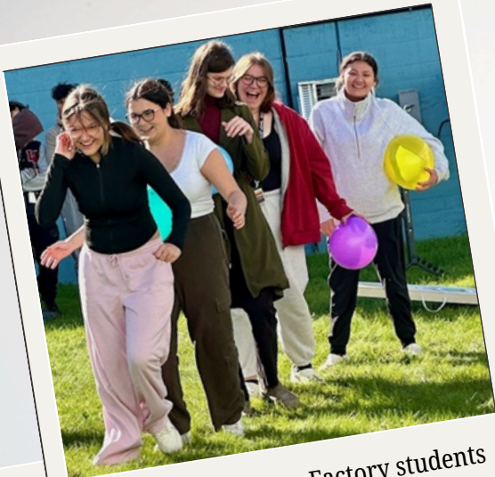
Moosonee & Moose Factory students taking part in celebration activities.