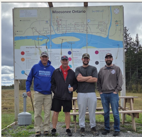
Winners of the Moosonee Fishing trip arrive.