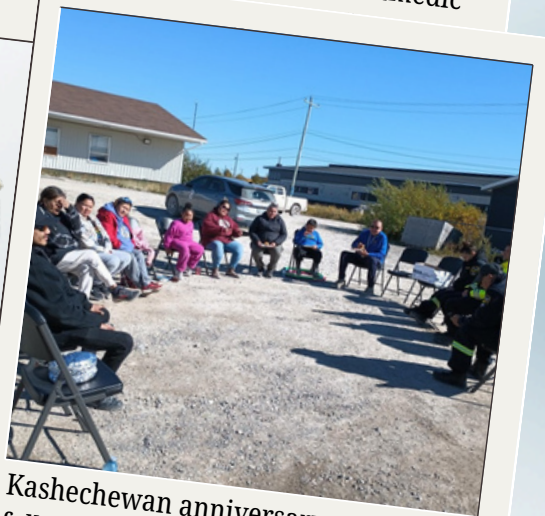
Kashechewan anniversary community folks gathering to celebrate 15 years of WAHA.