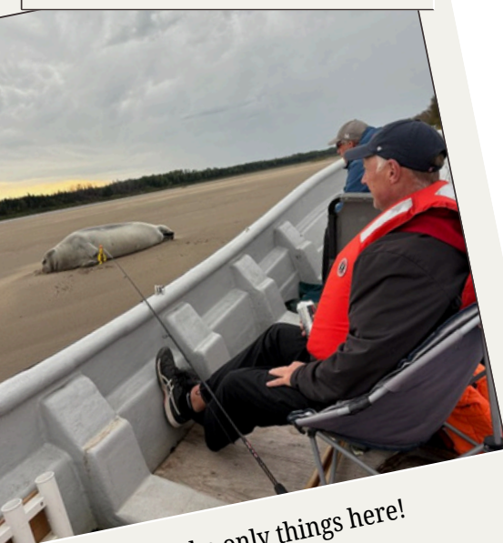
Fish aren't the only things here!