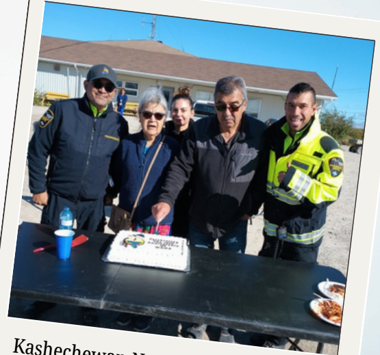
Kashechewan Nursing & Paramedic