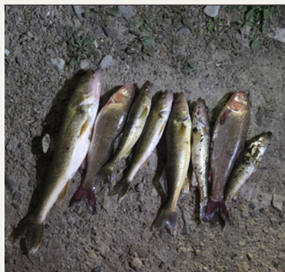
Not a bad day of fishing.