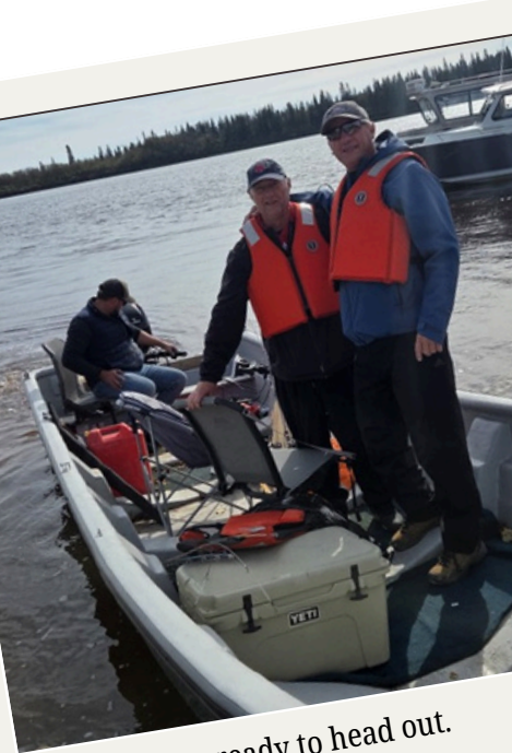
Getting ready to head out.